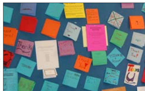
Student Thank You Notes