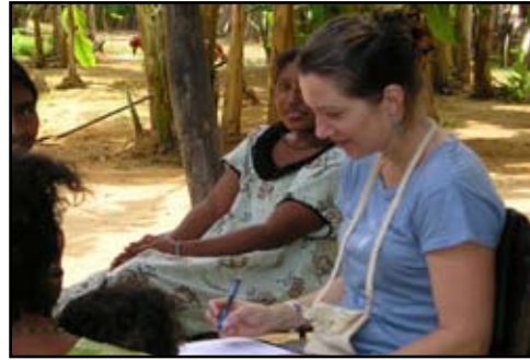
Interviewing Wayuu girls in Bella Esperanza Barrio, Maracaibo, 2006