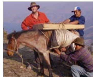
Equipo caballo-the horse team