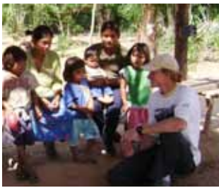
Visiting friends in the village of Limoncito in 2009.

This past November, I returned to the U.S. from my fourth fieldwork session among the Tsimane, an indigenous group of some 12,000 who live in the lowlands of Bolivia. Each year, this trip takes me through either La Paz (in the highlands) or Santa Cruz (in the lowlands) to San Borja, a small, rugged town in roughly the center of Tsimane territory. Upon arrival in San Borja—which often reeks of decaying cattle blood dumped by slaughterhouses into the surrounding marshes—my primary goal becomes departure for the greener and friendlier territory of the Tsimane villages. Travel time to the villages ranges from less than an hour to three days by motorized canoe up or down the Maniqui River, or by truck on one of the logging roads that have been cut into the forest. My dissertation work there has focused on understanding the microeconomics of making a living through farming, hunting, and fishing, and the mechanics of social support between families in the absence of loans, insurance, or formal institutions of governance.