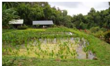
Growing taro in the Lower Nuulii lo'i.