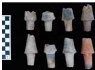
Sicán tuyeres used for copper smelting recovered during fieldwork. Sicán metal smiths created the draft for their furnaces by blowing through canes affixed with these ceramic tips.