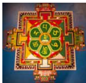
Sand painting or mandala

Funding provided by Wenner-Gren Foundation, UNM Institute of Public Health, Department of Anthropology, Office of Graduate Studies, and Latin American & Iberian Institute