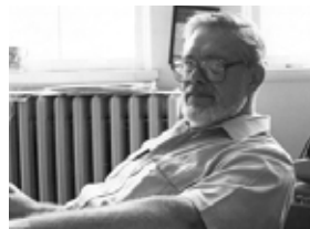
Lewis R. Binford

Dr. Lewis R. Binford, retired Emeritus Professor at both Southern Methodist University and UNM died in Kirksville, Missouri, on April 11.