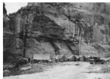
UNM Field School Camp -- 1931