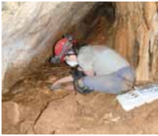
Removing samples of bone fragments from skulls that were destroyed during recent looting in Midnight Terror Cave.

Last August I returned from my third field season of dissertation research at the site of Midnight Terror Cave in the Cayo District of western Belize. This project has been part of a longer collaborative effort with California State University, Los Angeles. My dissertation research focuses on ancient Maya skeletal remains at the site. I am particularly interested in the social status of individuals, period of deposition, and contextual information that can be used to determine why they were deposited in the cave. Although iconographic, ethnographic, and ethnohistoric information on cave utilization has been useful in determining the ritual nature of cave deposits in general, the exact intent behind the deposition in this cave requires a multifaceted explanation that involves scenarios of sacrifice and ancestor veneration in both primary and secondary depositional contexts. Preliminary data indicate a heavy Terminal Classic (AD 800–1000) component, suggesting that some individuals may have been sacrifices as part of petitions to the rain gods offered at a time of increasing environmental fluctuation and draught. Thus far I have analyzed more than 40 individuals, with many more awaiting analysis.