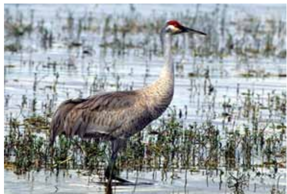
Sandhill Crane, Bosque del Apache