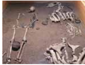
Elite warrior and his horse from a central Italian Iron Age necropolis