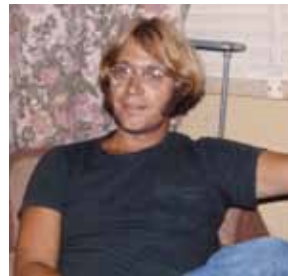
Mexico City, 1974