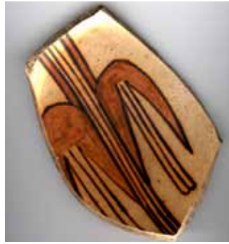
Sikyatki Polychrome sherd found at Pottery Mound, possibly showing a bird. Maxwell Museum Catalogue No. 98.53.172