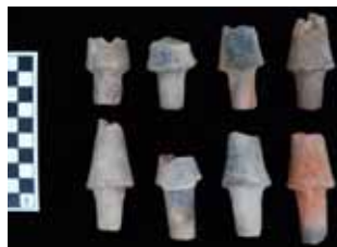
Sicán tuyeres used for copper smelting recovered during fieldwork. Sicán metal smiths created the draft for their furnaces by blowing through canes affixed with these ceramic tips.