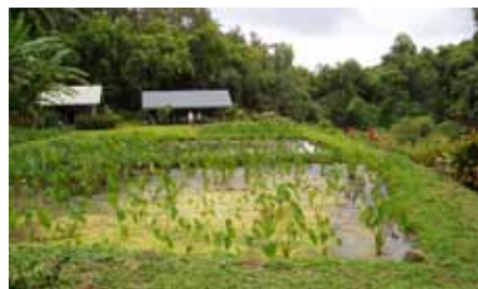
Growing taro in the Lower Nuulii lo'i.