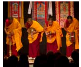
Gaden Shartse Monks