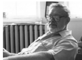
Lewis R. Binford

Dr. Lewis R. Binford, retired Emeritus Professor at both Southern Methodist University and UNM died in Kirksville, Missouri, on April 11.