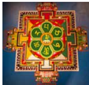
Sand painting or mandala

Funding provided by Wenner-Gren Foundation, UNM Institute of Public Health, Department of Anthropology, Office of Graduate Studies, and Latin American & Iberian Institute