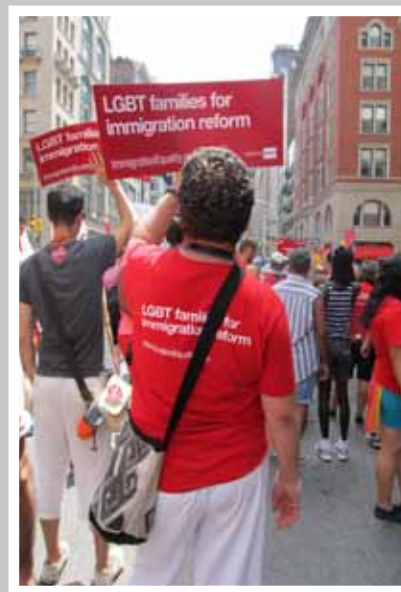
LGBT Pride Parade; New York, NY, 2012

vocality of citizenship, and the extent to which discriminatory laws impact individuals’ everyday lives. Although I have not yet completed full analysis, I expect that the interviews will provide significant insight into the dynamic relationship between binational same sex couples, popular discourse, and the state. As I move out of the field-work stage and begin the process of serious analysis, I am looking forward to what is to come.