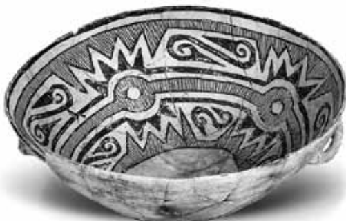
Puerco Black-on-White, AD 1030-1200.